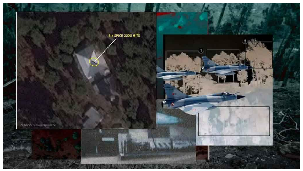
Figure 1 JeM training camp in Balakot, Pakistan

Key incidents underscore this narrative. On 13 December 2001, five Jaish-e-Mohammed terrorists attacked the Indian Parliament, killing nine, in the worst assault on India's legislature<sup>3</sup>. India held Pakistan responsible for harboring the attackers. In November 2008, ten LeT operatives carried out coordinated assaults in Mumbai (the "26/11" attacks), killing 166 and wounding scores. Pakistan's accountability for 26/11 remains an ongoing contention. On 14 February 2019, a Jaish suicide bomber killed 40 Indian security personnel in Pulwama (J&K). India responded with airstrikes on a JeM training camp in Balakot, Pakistan (the February 26, 2019 strike), killing "a very large number" of terrorists and trainers<sup>4</sup>.