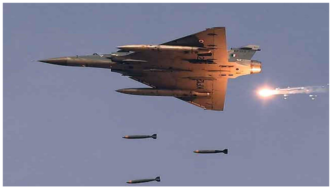
Figure 2Indian Air Force attack in Pakistan

India's strategic doctrine has evolved through these episodes. The Narendra Modi government has repeatedly stated that cross-border terrorism will be treated as an act of war and met with direct military action if necessary. In September 2016, following terror attacks in Poonch and Uri, the Indian Army carried out coordinated surgical strikes against terrorist launch-pads across the Line of Control<sup>7</sup>. The official DGMO press statement announced that these were pre-emptive strikes on infiltration points, aimed "to ensure that terrorists do not succeed in their design". India emphasized that no further strikes were planned but that its forces were fully prepared and offered Pakistan diplomatic cooperation to curb terrorism from its soil<sup>9</sup>.