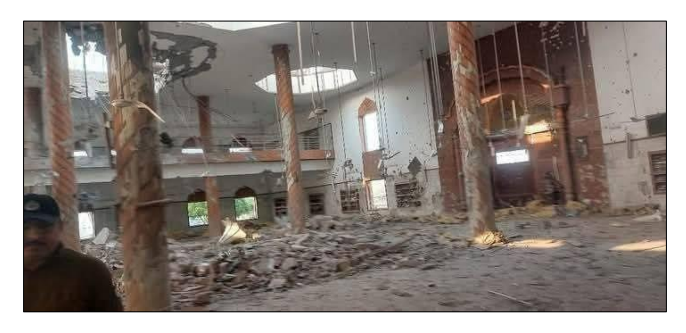
Figure 3Lashkar's Muridke HQ and Jaish's Bahawalpur HQ has been completely destroyed.