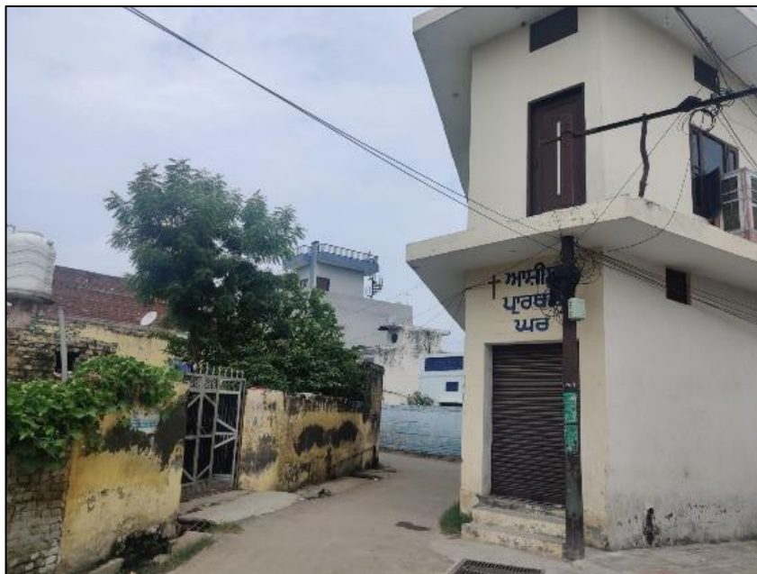
Figure 1 Small Home Churches

This was part of an expansive civilizational substitution plan. Evangelism operated as