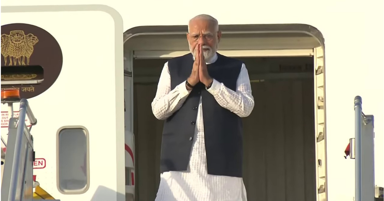
Prime Minister landing in New Delhi after cutting short his Saudi Arabia visit on April 23, 2025.

Within hours of the attack, Union Home Minister Amit Shah cut short his schedule in New Delhi and flew to Srinagar to spearhead on-ground security operations. Upon arrival, he chaired a high-level security review meetings with Jammu & Kashmir's Lieutenant Governor, J&K CM Omar Abdullah and senior police and army commanders, directing immediate reinforcement of counter-