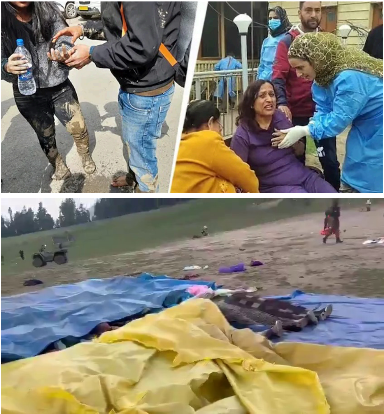
Innocent victims of the Pahalgam Terrorist Attacks

murdered also included IB & Navy officers. The list of victims spans multiple Indian states, reflecting the valley's diverse tourist demographic. 7