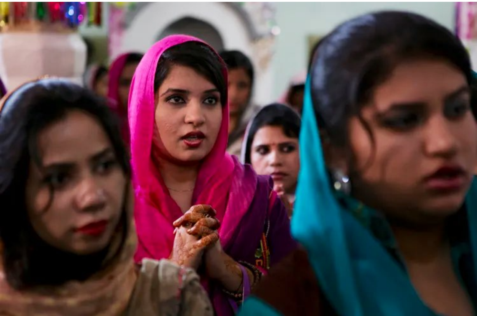
Hindu girls praying at a local temple in Rawalpindi, Pakistan